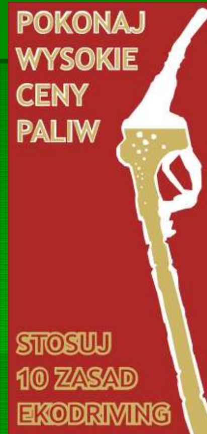
Postcard – 10 rules of eco-driving