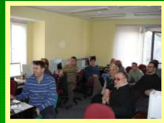
8 February 2008 – Training in Wrocław.