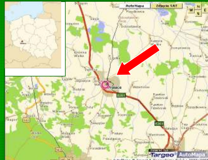
Location of Prusice